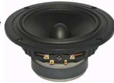
5" PPM WOOFER