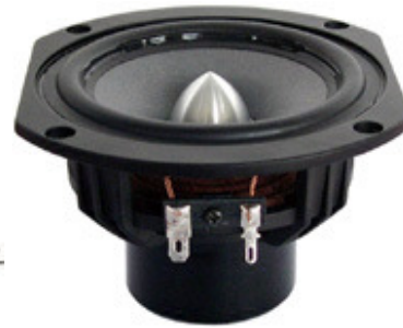
4" PAPER FULL RANGE